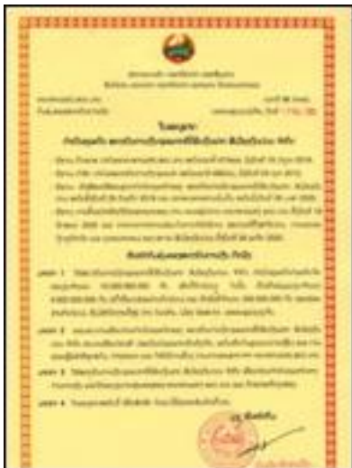
License to operate a business Loan rental service