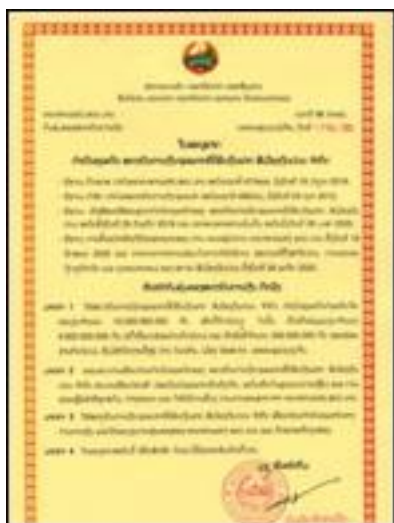
License to operate a business Loan rental service