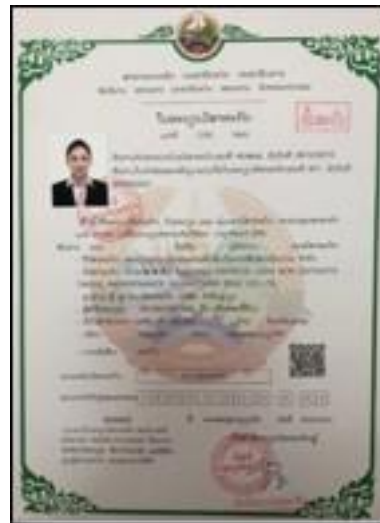
Enterprise registration certificate in order to start the business of the company, which consisted of company name, registered capital, related business, management style, office and was registered under the law on enterprises No. 46/ Nor Phor, dated 26 December 2013 issued by the registrar, Enterprises, Department of Registration and Enterprises, Protection, Ministry of Industry and Trade.